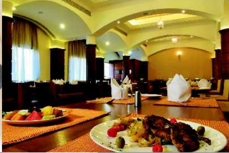
Indus - Multi Cuisine Restaurant