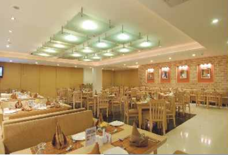
Indus - Multi Cuisine Restaurant